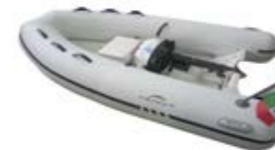
Confort / Open