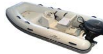
292 Duetto / Sport / Open