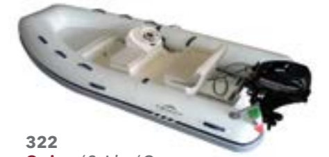
322 Cruiser / Spider / Open