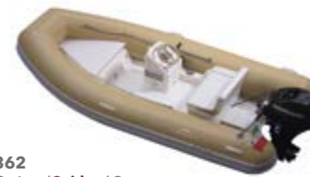
362 Cruiser / Spider / Open