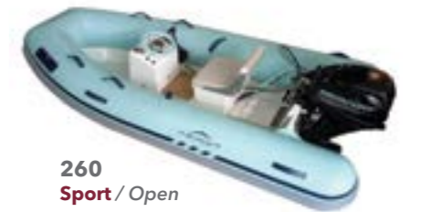
260 Sport / Open